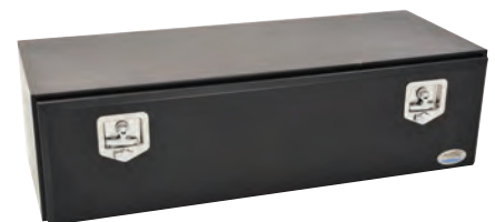
Black powder coated low profile models.