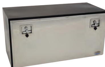
Black powder coated with stainless steel lid.