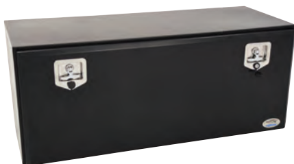
Quality black powder coated 1.5mm mild steel truck tool box.